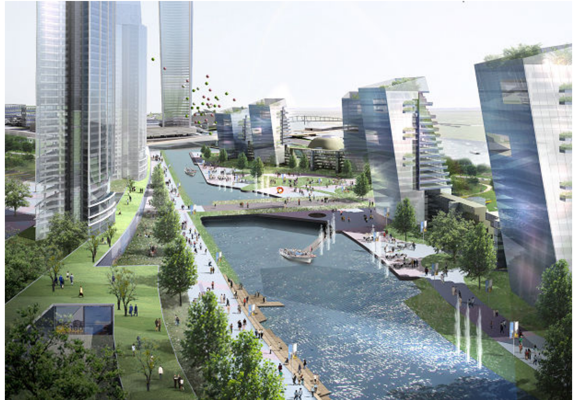
Sa-dong Ansan (Bird's-Eye View)

GS E&C's new orders has steadily increased and this year's new orders target is 10 trillion won. With the success of the “Eco Nomos,” GS E&C will achieve it's vision 2010.