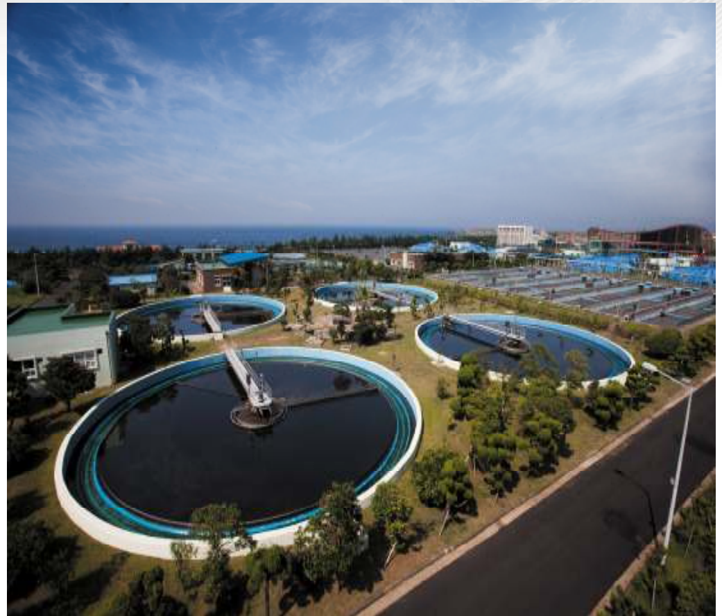
<Jeju, Water Treatment Plant Project >