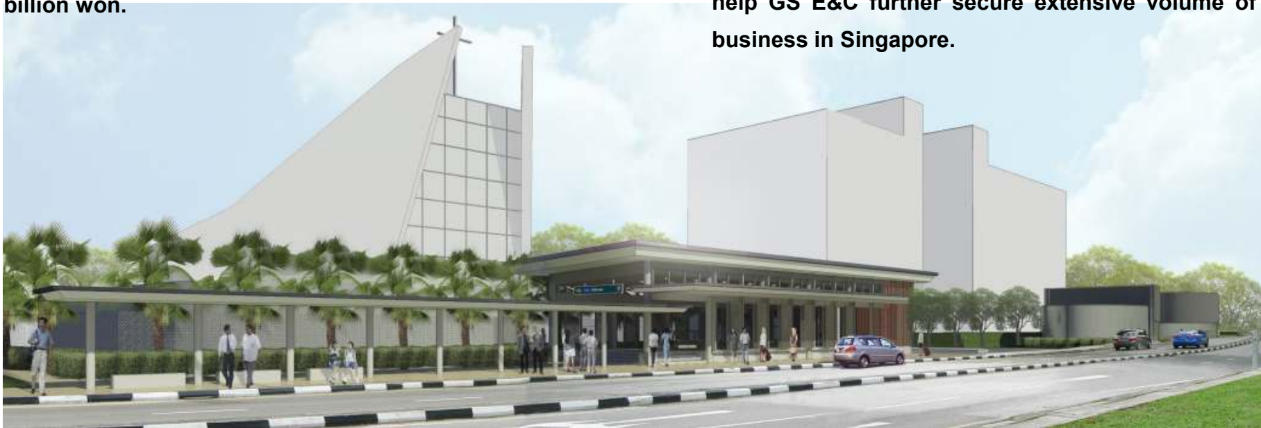
<Singapore, C-913 Project, Entrance Perspective >