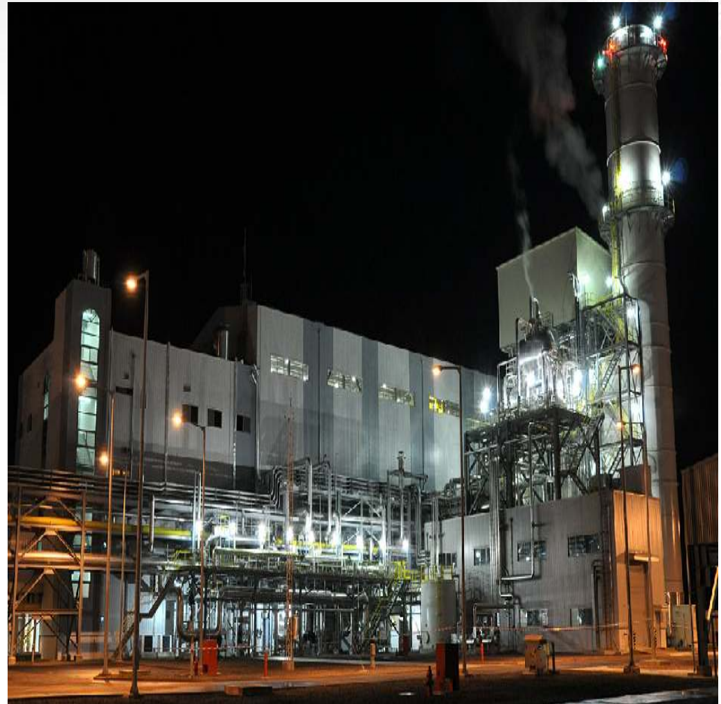
< Yerevan Combined Cycle Power Plant >