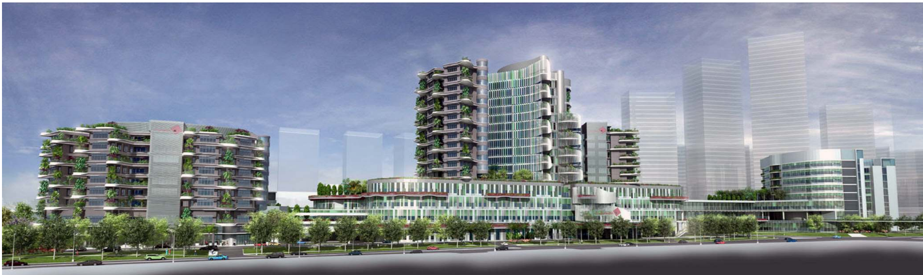
< Singapore, Ng Teng Fong Hospital Project >