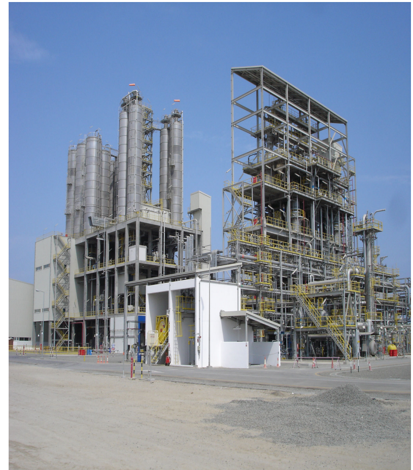
<Completed Oman PP facility in 2006>